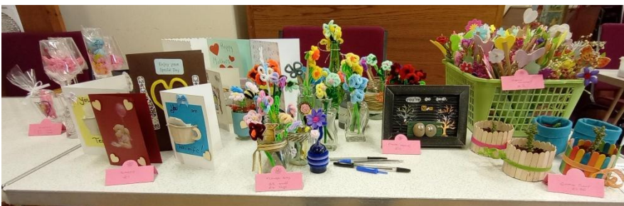
Items we made for our Mothering Sunday Celebration

On Saturday 29 th March we had a fund-raising event for BB&GA funds. This was a Mothering Sunday Celebration and Lunch. During the previous weeks we made crafts and cards for Mother's Day and Easter. Some were taken home, and many were sold at the event. On the last meeting before Easter, we watched the 'Easter Story' and made Stained Glass Crosses, which made up part of the Easter display in the windows of the Church & Centre.