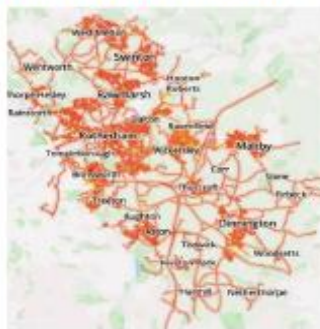
The Route covered in March 2026